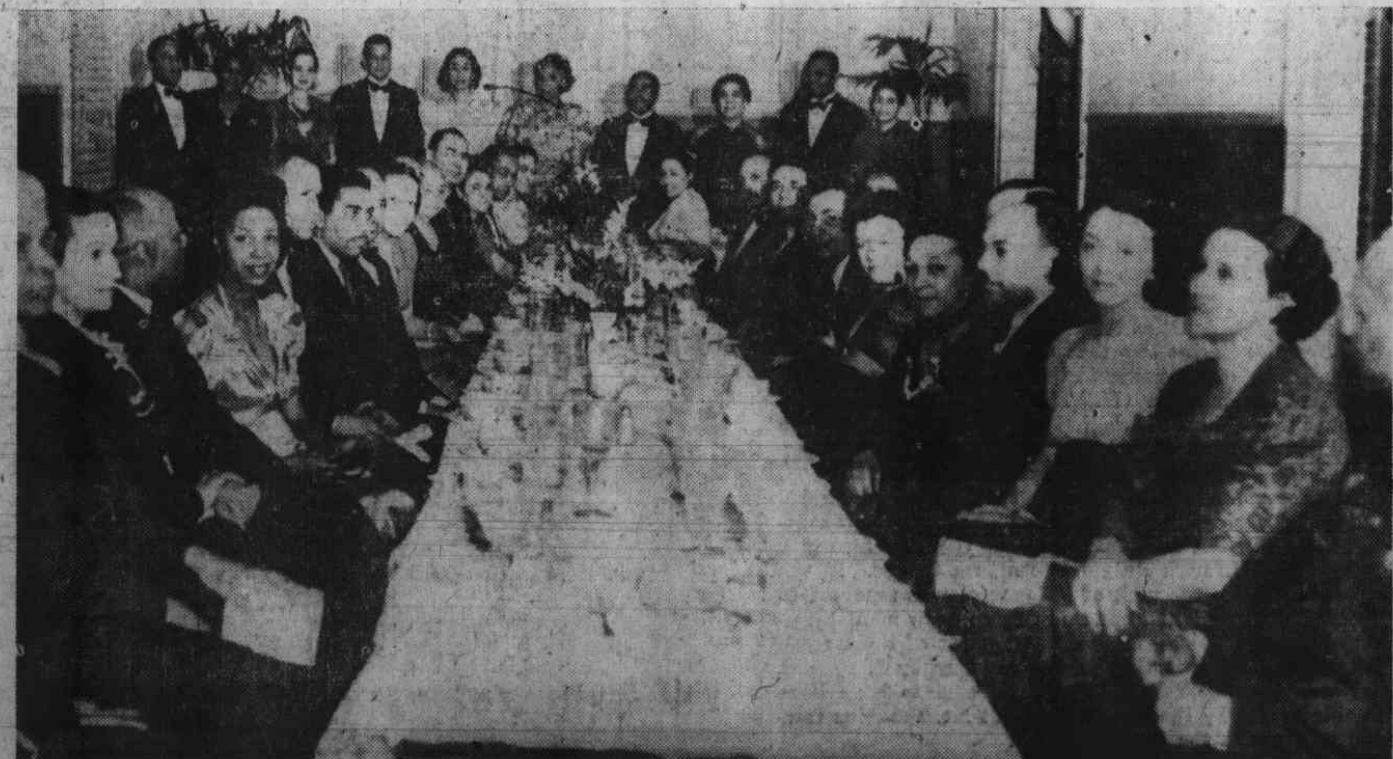
As is usually the case the Algonquin Tennis Club social affairs are unusually brilliant. The pow-wow held last year was one of the season's top-ranking social events.