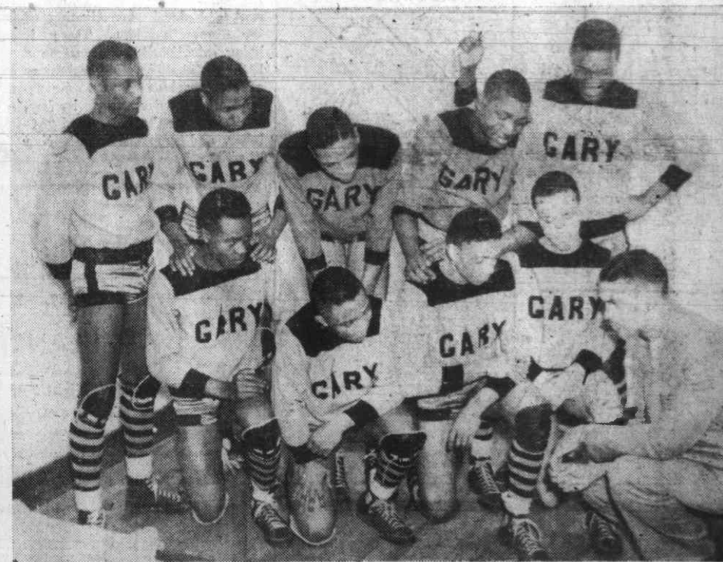
The national Basketball Tournament held at Fayetteville State Normal was attended by outstanding Basketball teams from various sections of the nation. After battling for most of the week the Gary, Ind., Basketeers emerged as the nation's championship team.