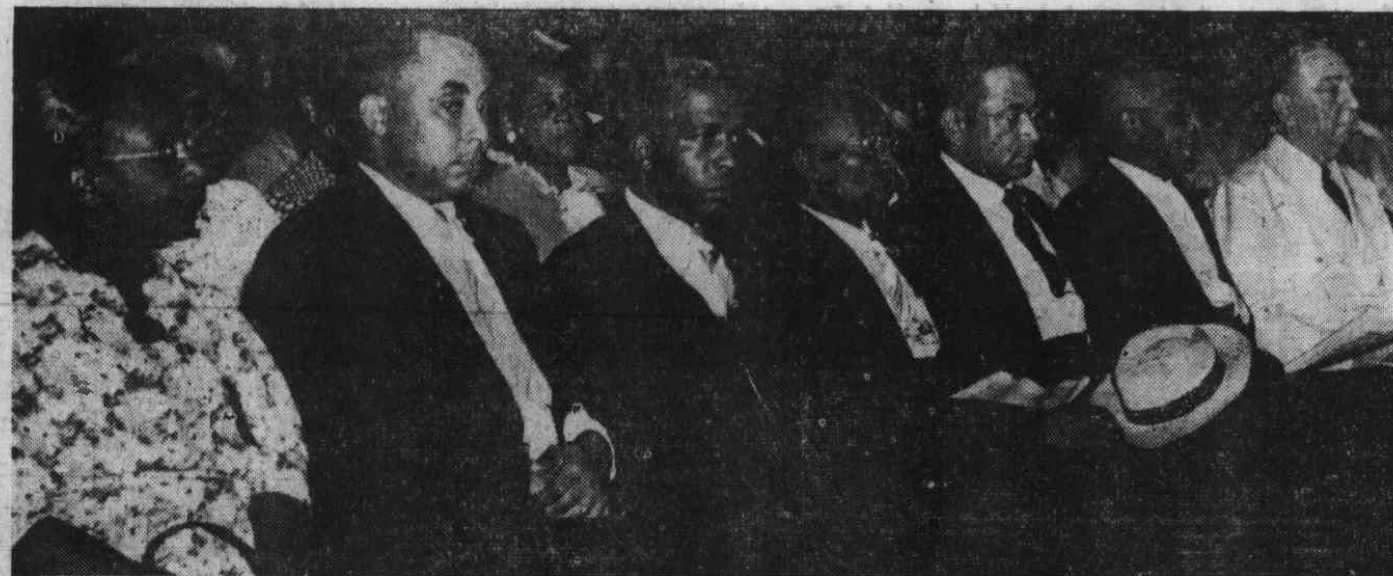
The North Carolina Baptist Convention which was held in Raleigh was one of the best according to delegates and visitors. The public gathering which included ministers from various other churches in Raleigh was a most momentous event. Several of the dignitaries are shown seated on the platform while the principal address was being delivered.