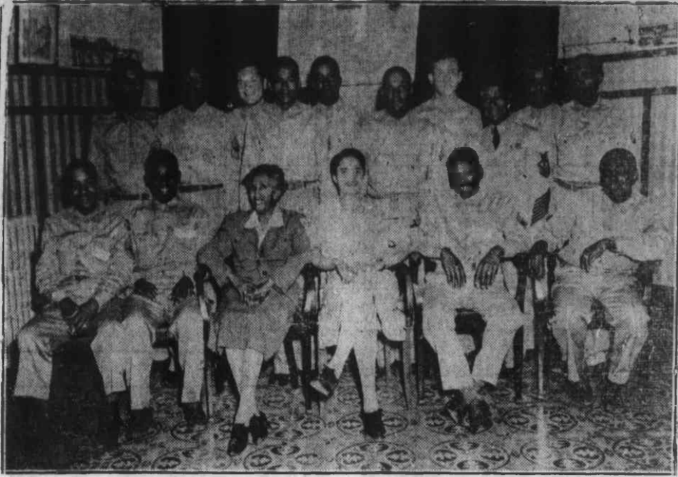
CASABLANCA —Members of the House Committee of the American Red Cross Service Club in Casablanca, North Africa, pictured during one of many conferences on plans for entertainment of Negro troops of United States armed forces.

Would you have it otherwise?" asked Msg. Haas. "Would you have the spirit