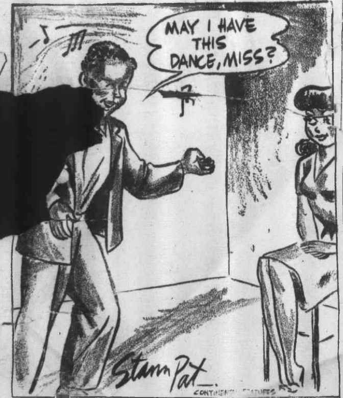
"DO ASK THE LADY FOR THE DANCE, BEFORE YOU PULL HER OUT OF THE CHAIR."

9. Seek provision of more adequate custodial services for maintenance of expanding school plants.