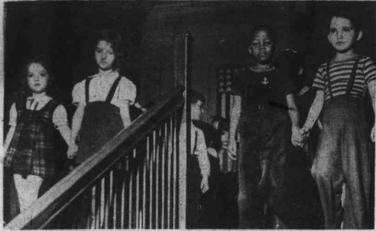
The wall-mounted speakers, fire drill. The radio and electric of a typical RCA school sound system guide these children safely and efficiently during a progressive education through the