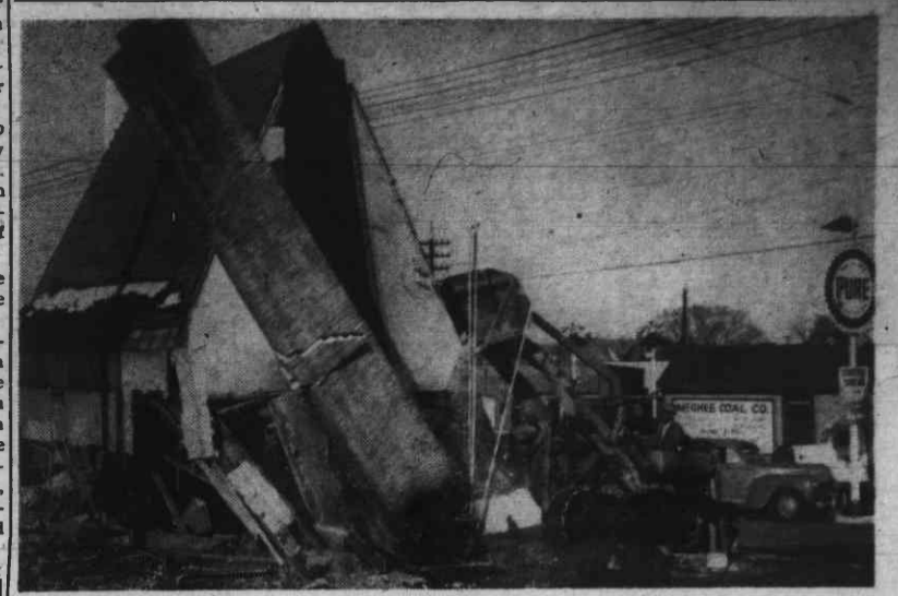
Pictured above is the demolishing of the old Speight's Auto Service Station to make room for a new and modern Pure Oil Station to be located on the same spot at the corner of Fayetteville and Pettigrew Streets. The new establishment is fast becoming a reality with the builders now putting on the finishing touch. Plans for a Grand Opening will be announced in this newspaper during the early part of March.