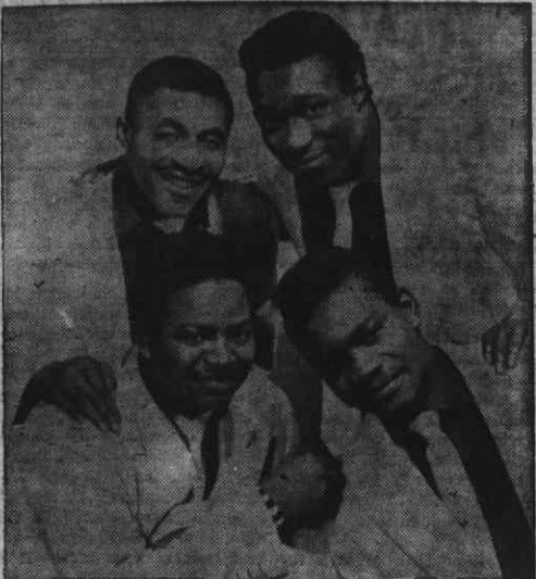
THE FAMOUS MOONGLOW QUARTETTE