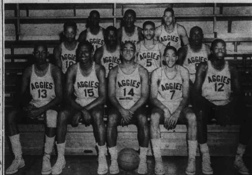
The Aggies of A and T College finished fourth in regular season play in the CIAA. Members of the A and T quintet