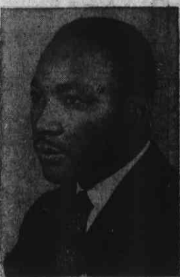
DR. MARTIN L. KING