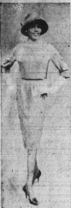
A large pin at the neckline adds the accessory spark to a suit that can double as a dress. It's an exclusive design by French couturier Givenchy for McCall's Patterns. So smart in sheer wool, linen, shantung, crepe or cotton... it's right for Spring when you sew-your-own. McCall's #4662. Sizes 10-16. $1.00.

Every year when those "best-dressed women" lists are published, one of the ladies honored almost always comments, "I don't really have an extensive or expensive wardrobe, but I do try to vary my accessories and select them with great care." There's no doubt that a tasteful collection of accessories can do wonders in adding interest or excitement to the simplest, most conservative dresses and suits.