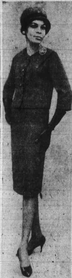
Simple Elegance takes center stage with a Pierre Cardin design for McCall's Patterns. Make-it-yourself in sheer wool tweed, linen, cotton suitings and accessorize with an interesting pin, eight button length gloves and a smart new hat. McCall's Pattern #4694. Sizes 10-18. $1.00.

A mistake that is sometimes made is to wear too many startling accessories.