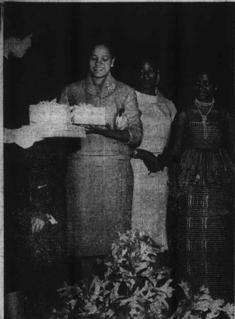
STRIKING VISITORS —The women of the Toure delegation cut a striking fashion figure during their visit to the city last Thursday. Some conception of their impact on the town can be gained from this picture taken of three of them receiving a gift