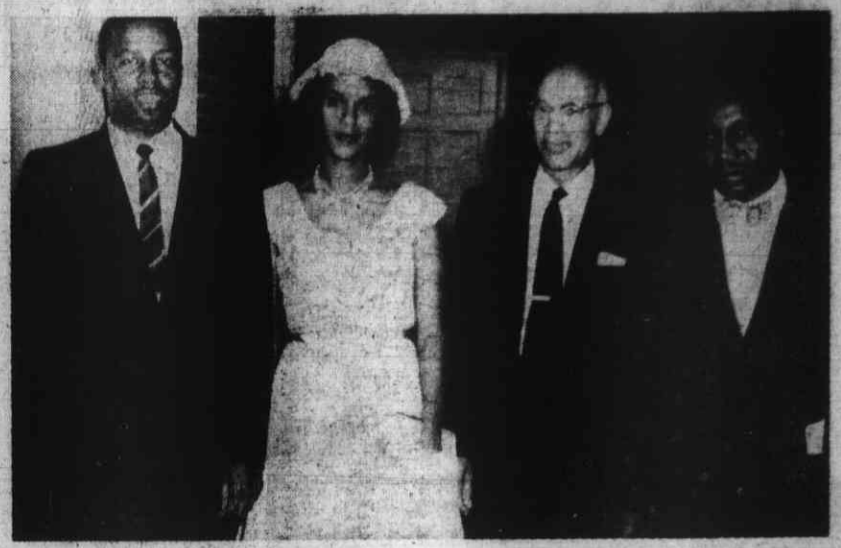
PRINCIPALS IN TESTIMONIAL

—As a prelude to the opening of the annual North Carolina Conference of the Methodist Church meeting in Durham this