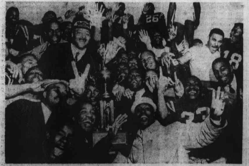
AGGIES CELEBRATE — The A. and T. College Aggies "whoop it up" in the dressing room following their crushing 28-7 win over the North Carolina College Eagles in the annual Carolina Classic football game played at Durham on Thanksgiving Day. The boys show the Bull-Eagle Trophy, given by the Coca-Cola Company, on which the