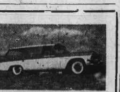
DID YOU KNOW

There are three types of awards: U. S. government full grants; join U. S. other government grants; and U. S. government travel-only grants. Full grants provide round-trip trans-