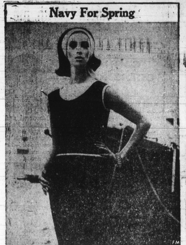
Navy For Spring Q. What's the news about navy for spring? A. Zefkrome acrylic fiber, which gives double knits "body" and wash-'n-wear independence. California Girl uses miracle Zefkrome for a navy two-piecer that plays at being a dress. White is a natural contrast for the striped dickey and trim, and the skirt is built on a camisole to do away with waistline clutter.