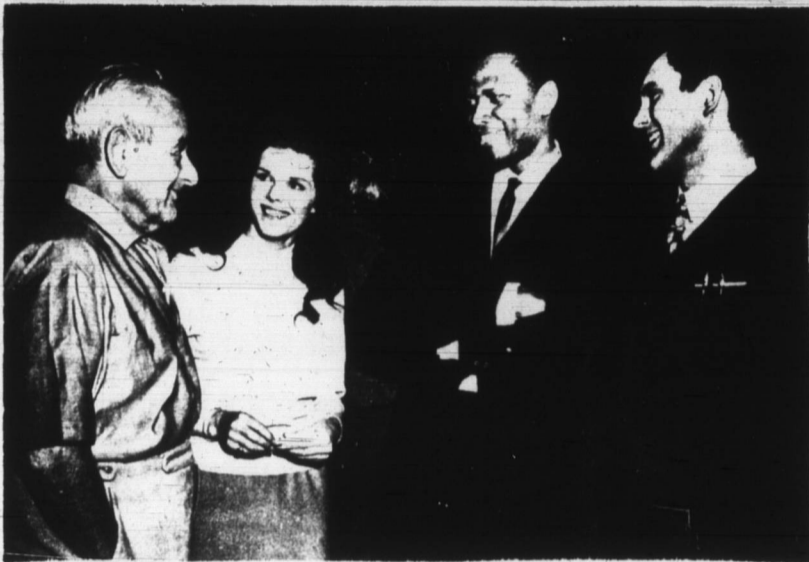
STARS RELAX —On the set of "The Collector", William Wyler (left) much honored film director, relaxes with stars Samantha Eggar and Terence Stamp (right), and visiting star Sidney Poitier, between filming takes. Miss Eggar and Stamp, who won top titles at Cannes, France, star in "The Collector", directed by Wyler.