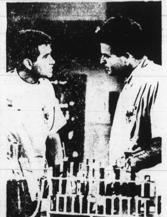
MC MULLAN JOINS "WAR ON NERVES" JIM McMULLAN as Dr. Terry McDaniel, consulting here with Vincent Edwards as Dr. Ben Casey, becomes a member of the staff of County General Hospital, in "War of Nerves," the 5th season's opener of ABC-TV's "Ben Casey," Monday, Sept. 13 9-10 p.m.