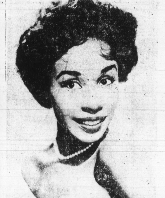
HOME IS WHEREVER SHE HANGS HER HAT LOVELY DIAHANN CARROLL explains "Any Place I Hang My Hat is Home" on the "Dean Martin Show" when the leisurely paced weekly hour open the season on Thursday, September 16 at 9:00 p.m.