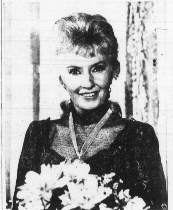
Television Emmy Award winner Barbara Stanwyck, who has also been honored by four nominations for Hollywood's Oscar, returns to TV as star of "The Big Valley" starting September 15, on ABC.

BIG VALLEY, CALIFORNIA — A new western series in color, so lavish and expertly written that viewers feel they are watching a major feature film rather than a video drama, brings Barbara Stanwyck back to the living room tube this autumn.