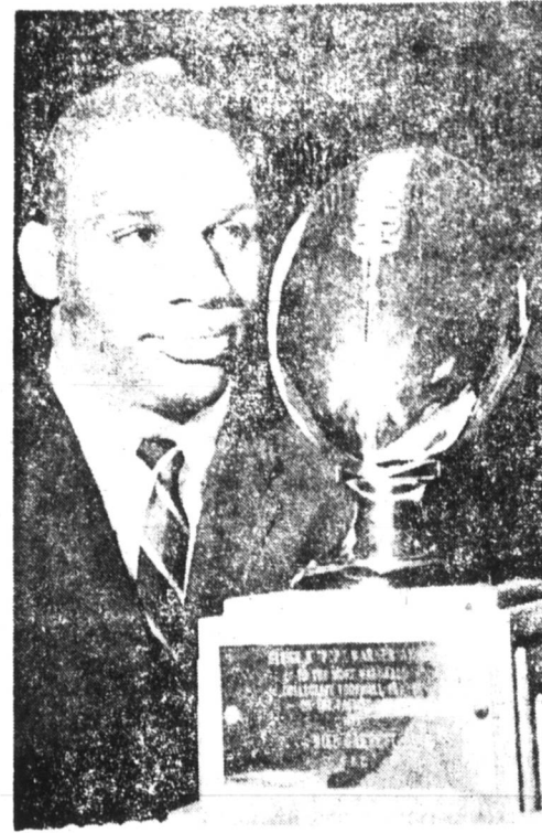
ANOTHER GOLD PIGSKIN. — Former University of Southern California halfback Mike Garrett collects another trophy as he is given the Pop Warner award by the Palo Club at its annual banquet. The award is presented annually to the outstanding senior player on the West Coast.