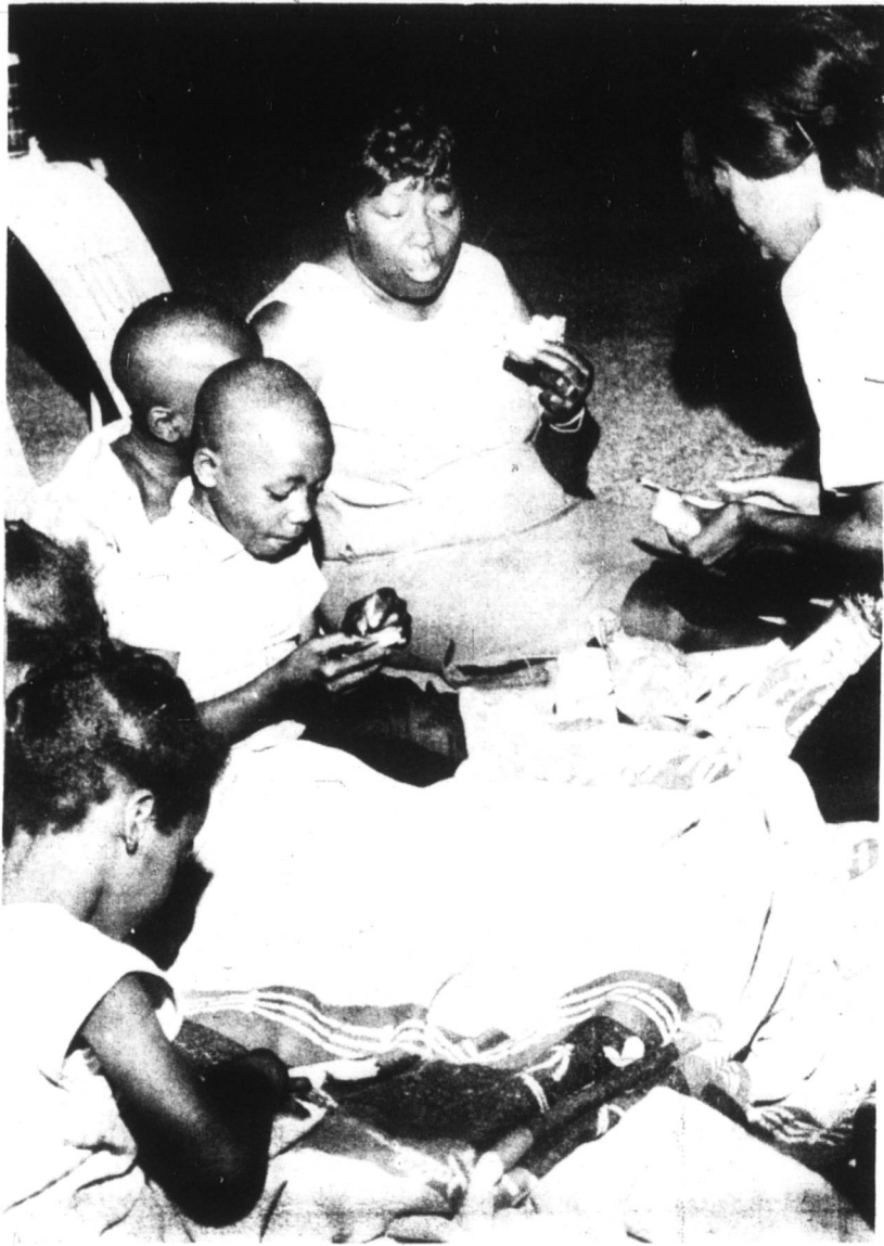
MIDNIGHT—(Philadelphia) — test demonstration on the steps for children of welfare recipients. Taking time for a midnight of the state building. The moth-snack, mothers and children are protesting the inadequate sandwiches during pre-quate amount of money allowed