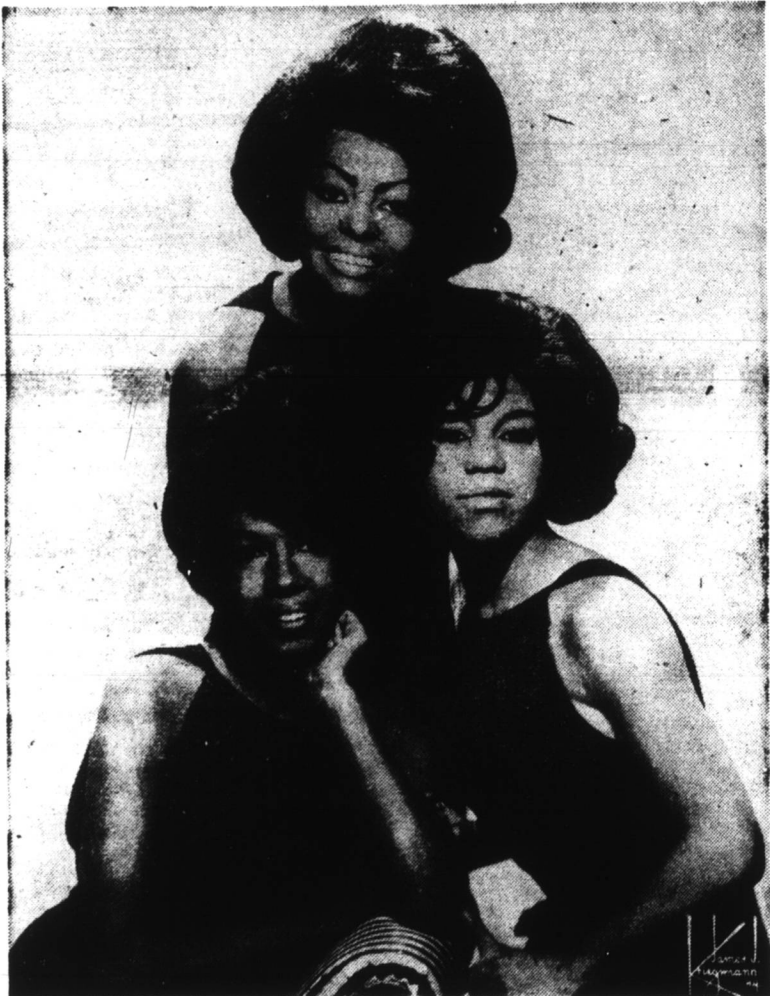
Another 'First' By The Motown Girls

The Supremes, swinging trio from Detroit, added another coveted honor to their spectacular list of accomplishments by winning an impressive victory in the annual jazz poll sponsored by Playboy Magazine. The girls with the "Motown sound" edged out the Beatles in the "Most Popular Vocal Group" category. Peter, Paul and Mary, last year's Playboy poll winners, placed third in the 1967 voting.