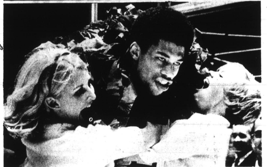
HUGS FOR THE VICTOR —(Louisville, Ky.)—UCLA's Lew Alcindor is hugged by two screaming Bruin cheerleaders following their victory over Dayton 79-64 in the finals of the NCAA Basketball Tournament at Freedom Hall March 25.