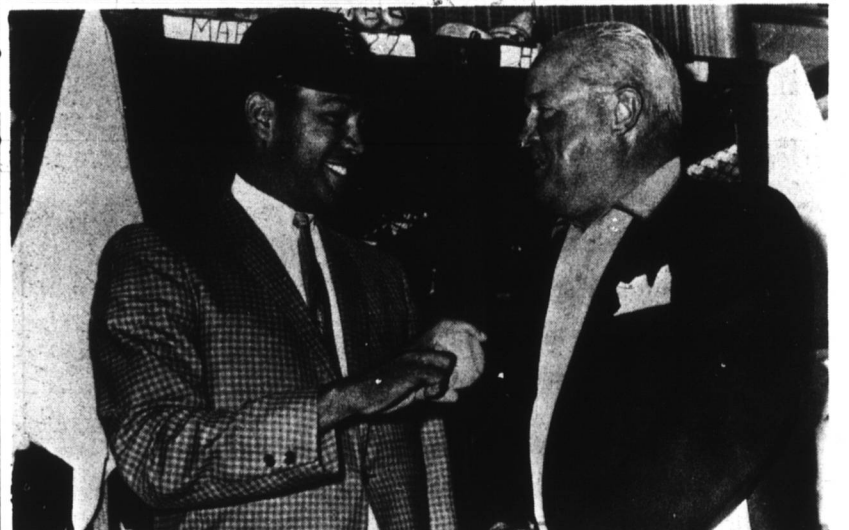
SIGNS $100,000 CONTRACT —(Phoenix)—Juan Marichal, who signed a $100,000 contract with San Francisco Giants, tries out a baseball with the approval of Giants owner Horace Stoneham (R). Marichal will be ended a 29-day holdout by signing workouts here.