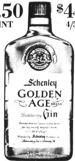
SCHENLEY DISTILLERS CO., N.Y.C. DISTILLED DRY GIN, 86 & PROOF. DISTILLED FROM AMERICAN GRAIN.