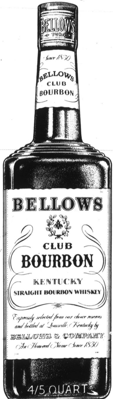
BELLOWS & CO., LOUISVILLE, KY. • KENTUCKY STRAIGHT BOURBON WHISKEY • 86 PROOF

Kentucky Straight Bourbon $2.50 PINT $4.00 4/5 QT.