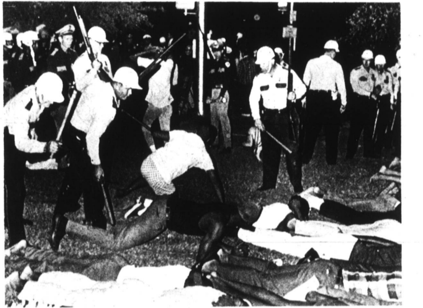
CAMPUS TROUBLE —(Houston)—Negro youths lie on the ground waiting to be taken to jail as Houston police made