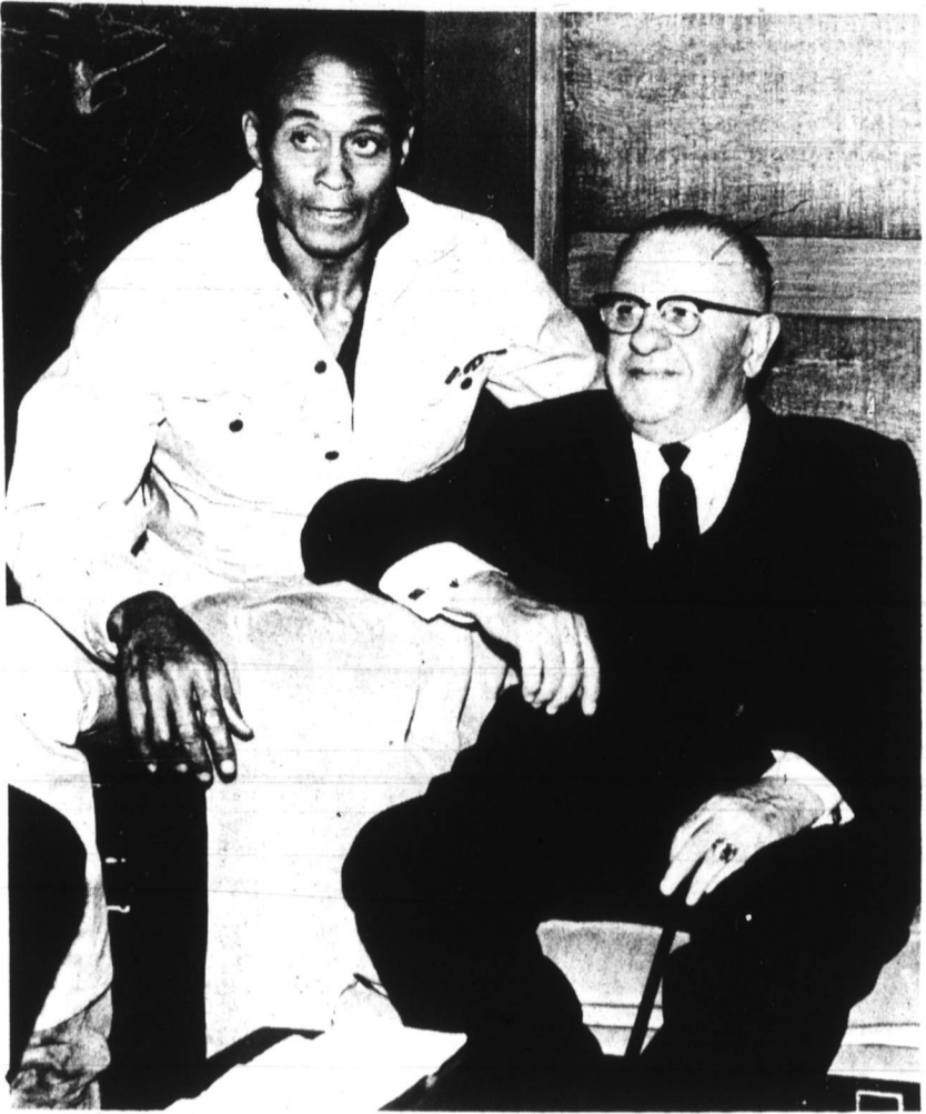
VETERAN ACTOR Woody Strode received a surprise visitor recently on the set of his current film, "World Premiere: Breakout," when Mr. Sunay, the president of Turkey, took time from an official visit to the U. S. to see how movies are made.