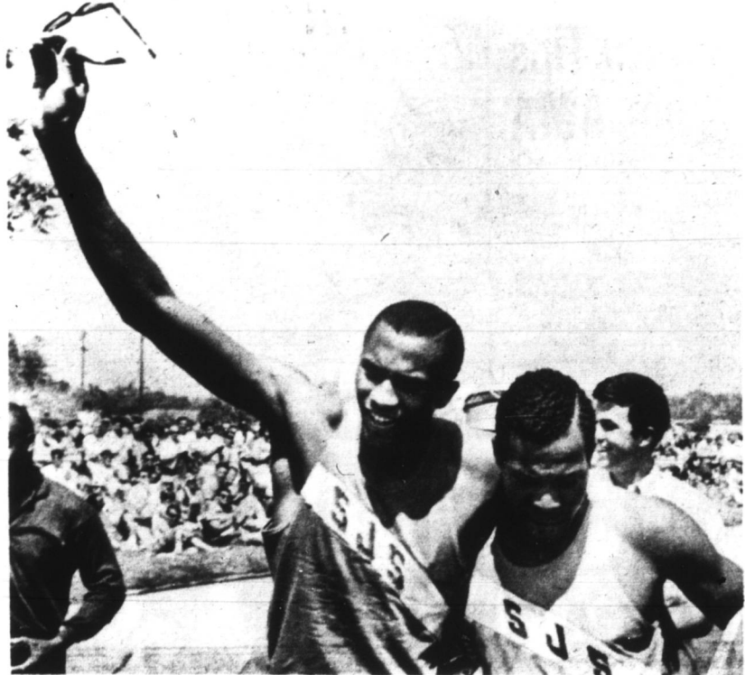
SETS WORLD RECORD — (San Jose, Calif.)—Tommy Smith (L) and teammate Lee Evans catch their breath just after breaking the tape in a climatic match race here May 20 in which Smith, the winner set a world record of 14.5 in the 400 meters and 44.8 for 440 yards. Evans, regarded as the world's top 440 man last year, set the pace to the last 50 yards when Smith went to the front to win by three yds.