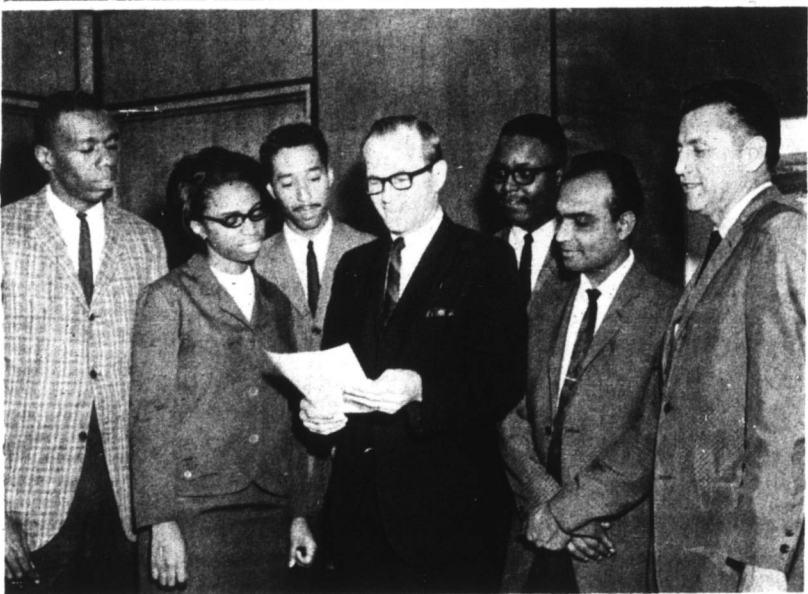
SIX SHAW INSTRUCTORS AWARDED SUMMER FELLOWSHIPS —Pictured with Shaw University's vice president for development are six instructors who have been awarded Business and Industry Fellowships for summer employment by the National Urban League. Left to right are: