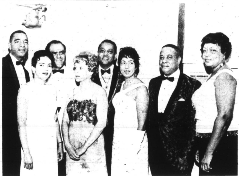
ANNUAL SPRING DANCE of Beta Phi Chapter of Durham and the Eta Chapter of Raleigh of the Omega Psi Phi Fraternity, given at the National Guard Armory here, May 26, was a gala affair and proclaimed by many as one of the season's top social events.