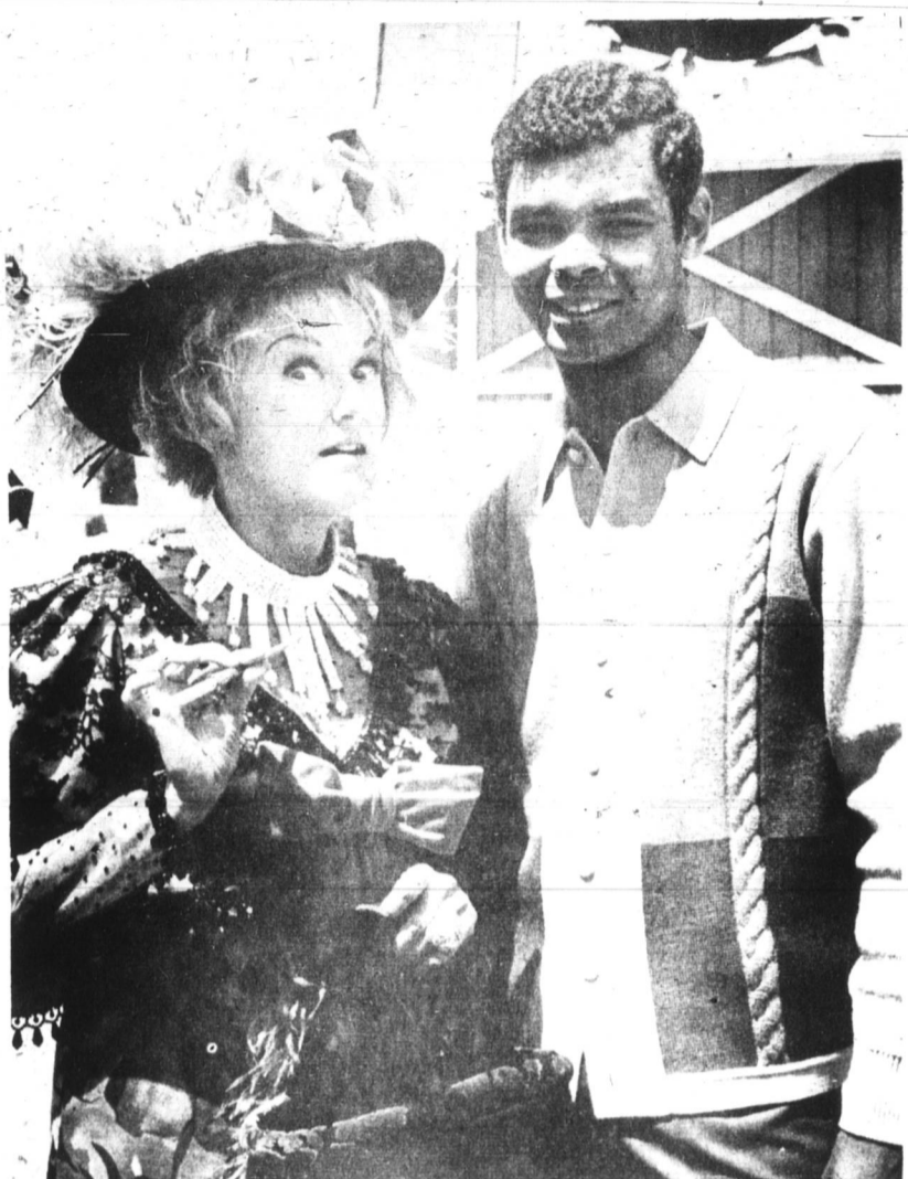
TIME OUT — Ronnie Eckstine takes time out from his featured role in MGM's "The Love In" to visit with Phyllis Diller on the set of her new movie, "Did You Hear The One About The Traveling Saleslady?"