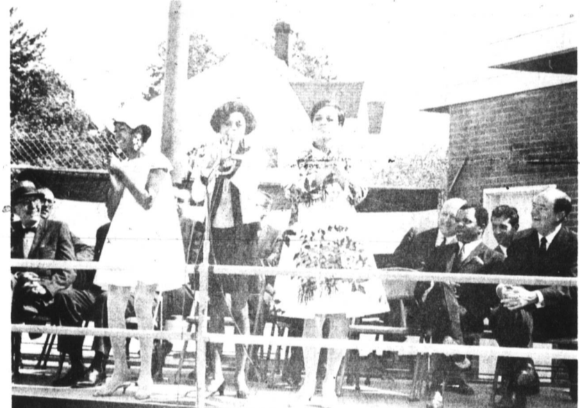
VICE - PRESIDENTIAL DELIGHT —Vice President Hubert H. Humphrey right smiles along with Berry Gordy, Jr., President of the Motown Record Corporation, while the fabulous Supremes perform during an outdoor swimming pool dedication for low-income youngsters who live in Washington's Frederick Douglas Homes. During the ceremony, the Vice President cited Mr. Gordy for his outstanding business accomplishments and praised the Supremes for their participation in civic affairs. The Supremes, left to right are Mary Wilson, Diana Ross and Florence Ballard. The Supremes participated in the ceremony while in Washington for a 10-day engagement at the capitol's prestigious Shoreham Hotel.

The winner enjoys sewing and sports. She has been in the Future Homemakers of America Club for two years. This