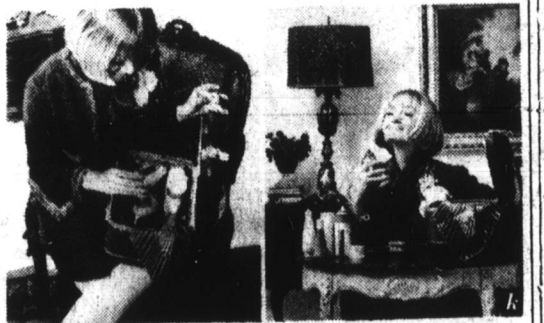
Femininity-unlimited: A complete fragrance trousseau, in unbreakable spray containers that pack and travel neatly with the bride on her honeymoon.

during a day of sightseeing or an evening of dancing. Now that you're ready to climb aboard that honeymoon express, remember to keep your traincase near you in transit. So much the easier to get to your beauty aids for instant freshening up before arriving at your honeymoon des tination.