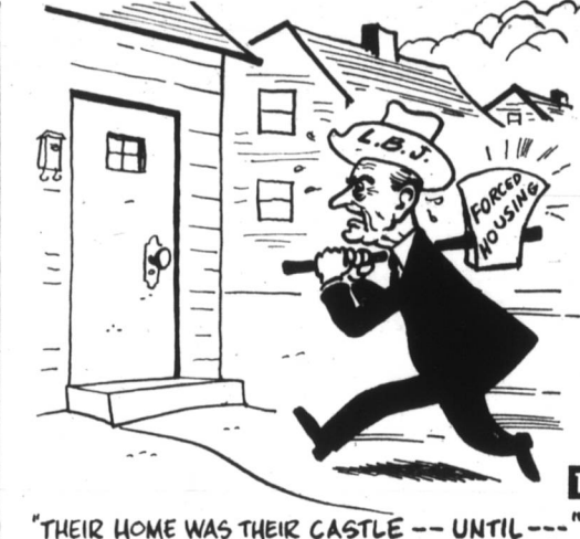
"THEIR HOME WAS THEIR CASTLE -- UNTIL --"

Can you guess what games these children are playing? The photos are scenes from a new film being shown free 25 times daily in the U.S. Pavilion at EXPO 67, Montreal, Canada. Sponsored by Polaroid Corporation, the film is titled A TIME TO PLAY. The movie gives us a close-up of ten games children play all over the world. It colorfully evokes childhood memories, and hints that games are often a reflection of the contests encountered in later adult life. The 20-minute movie is viewed on three screens. At times, there are different scenes on each of them, and frequently a single action sequence fills all three screens at once. Even the titles identifying the games take part in the movie's action. In the photos above, the children are playing: top, Blind Man's Buff; and bottom, Hide and Seek.