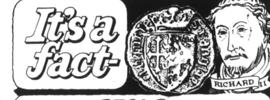
IMAGE BUILDER Did you know that you can improve the image you present to others by smoking cigars? Many people consider the cigar smoker elegant and mature, and offering a man a cigar has even been known to avert an argument.

HISTORICALLY, SEALS HAVE ESTABLISHED IDENTITY AND AUTHENTICITY. MANY ANCIENT EUROPEANS HAD SEALS. INDIVIDUALS HAD ONE, SOVEREIGNS HAD MANY.