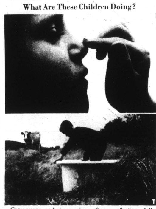
What Are These Children Doing?

AGENTS WANTED NOW MAKE EXTRA MONEY during your spare time as agent for North Carolina's oldest and fastest selling newspaper. For full details, write Carolina Times, 436 E. Pettigrew St., Durham, N. C. AGENTS WANTED in every city and town in North Carolina to sell the Carolina Times. For information on how you can earn money during your spare time, write: Circulation Manager, The Carolina Times, 436 E. Pettigrew Street, Durham, N. C.