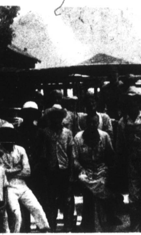
MEMBERS AND FRIENDS of Jefferies Cross Baptist Church who offered help in financial project. Among them are Dea-