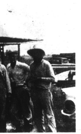
MEMBERS AND FRIENDS of Jefferies Cross Baptist Church who offered help in financial project. Among them are Dea-

Howard Theological Seminary, now Howard University, was founded in Washington, D. C. in 1866.