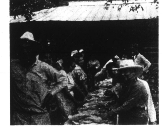
MEMBERS AND FRIENDS of Jefferies Cross Baptist Church who offered help in financial project. Among them are Dea-

that they were subjected to taxation without the right to vote. The farmer receives an average of 28 cents of each dollar spent by consumers on food, according to the Agricultural Department.