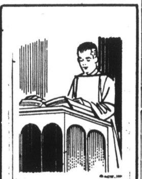
MESSAGE OF SUCCESS

Services at our Funeral home are tailored to meet the express wishes of the bereaved family. The refore, our staff is fully aware that routinized behavior has no place in our establishment. Every service represents a unique challenge and the appreciation of the family is our criterion of success.