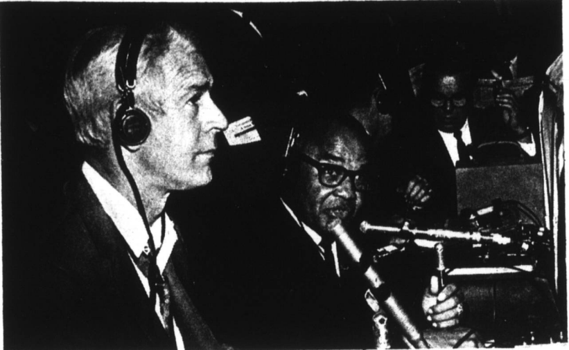
LENDING HIS EXPERIENCE — (St. Louis, Mo.) — Former welterweight champion Henry Armstrong (center) was on hand to lend his experienced sports director of the local CBS-owned KMOX radio, teamed up to announce the feature fight of the Arena Boxing Club's opening card.