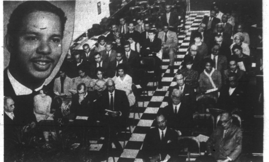
A SECTION OF THE STOCK- holders gathering to whom the reports of the bank were made. Present also were officials and