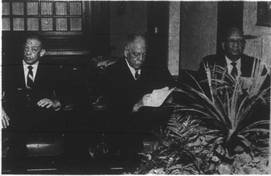
THE 60TH ANNUAL MEETING of the Stockholders of the Mechanics and Farmers Bank held here Jan. 7 was reported to have been one of the most enthusiastic in its history. With total resources nearing the $21

million mark those present were assured that the growth and development of the bank will continue throughout 1969. The above photo, reading from