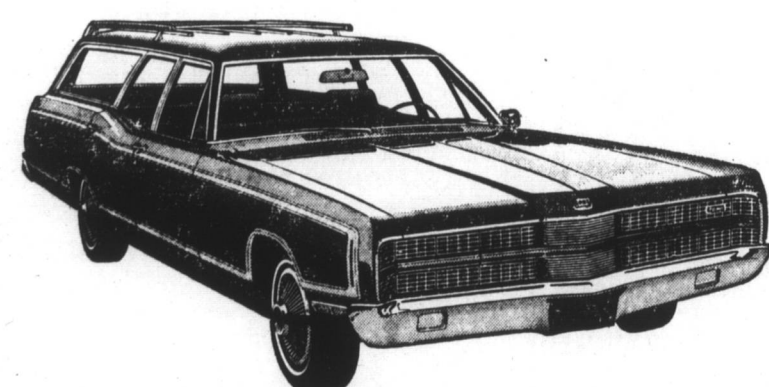
LTD 10-Passenger Country Squire

Fully equipped including factory air conditioning. 17 to choose from. Stock No. 1642.