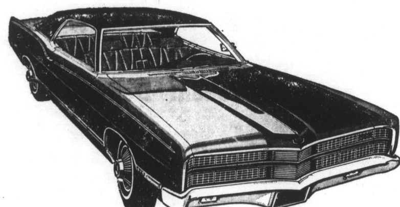
LTD 2-DOOR HARDTOP

Equipped with V-8 engine, vinyl roof, Cruisomatic, whitewall tires, power steering, tinted glass, radio, wheel covers. Many other extras. Stock No. 1664.