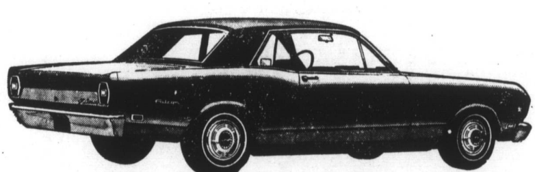
Falcon 2-Dr. Club Coupe