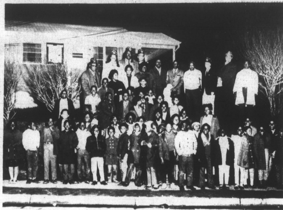
SHRINERS, DAUGHTERS OF 1515 ENTERTAIN RALEIGH KIDS — Members of Kabala Temple number 177, and Kabala Court of Raleigh, entertained fifty-four youngsters by taking them to the recent Ring-

Simmons Company (through Young & Rubicam Inc.) and Coca-Cola Company (through McCann-Erickson Inc.) each has half sponsorship of the special.