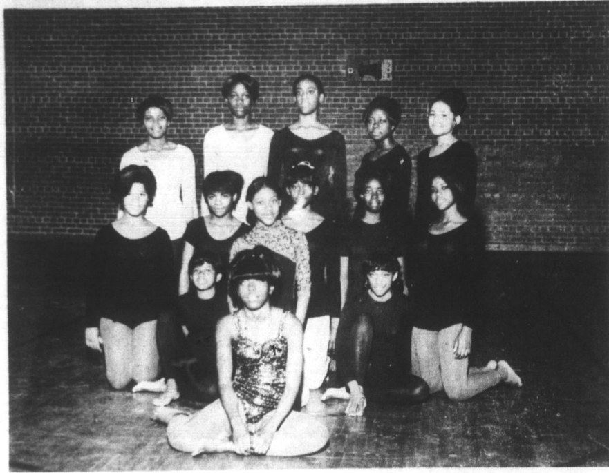
MEMBERS OF THE WHITTED Junior High Modern Dance Group who are presenting their annual spring recital, "Dance Unlimited" May 29 and 30, in the Whitted Gymnasium at 8:15 p.m.