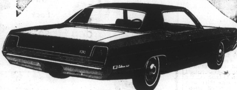
Galaxie 500 4-Door

Galaxie 500, 4-door, vinyl roof, Cruise-O-Matic, white walls, body side moulding, power steering, air conditioning, radio and heater, wheel covers.