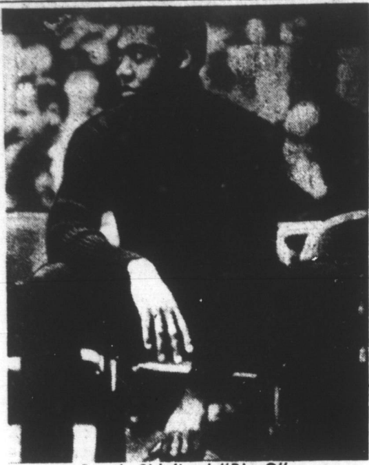
Royals Sidelined "Big O"

Shown here watching the action in a recent Cincinnati Royals-Seattle Supersonics NBA tilt from an unacclaimed seat on the sidelines is Oscar Robertson. Robertson, who was the controversial subject of an aborted trade that would have sent him to the Baltimore Bullets, is reported to be recovering from a groin injury he suffered after he invoked a clause in his contract that prevented the Royals from trading him without his consent. With Robertson missing from the lineup Cincinnati wound up on the short end of the score in the tilt won by Seattle, 121-115.