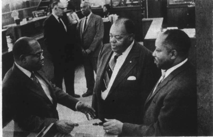
SHARES IN INVESTMENT - Indianapolis, Indiana - First State Bank of Danville, Va., has been selected one of ten minority banks across the country sharing in the investment portfolio of the Board of Church Extension of Disciples of Christ.