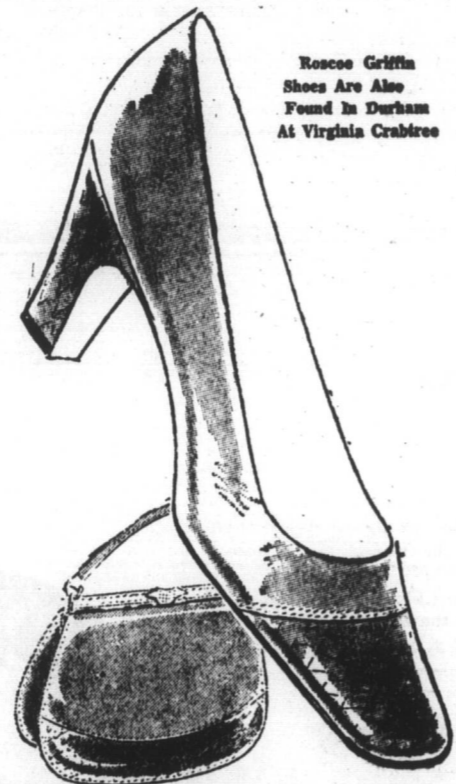
Roscoe Griffin Shoes Are Also Found In Durham At Virginia Crabtree

The plain and simple pump—with just a touch of trim in front—adds extra interest to your spring fashion balance. Flawless lines lead from the mid heel to the rounded toe. $20.