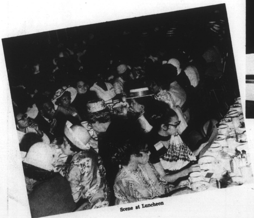
Scene at Luncheon