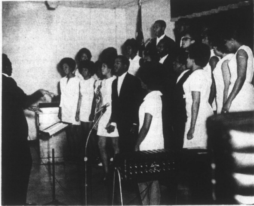
NEW GENERATION SINGERS