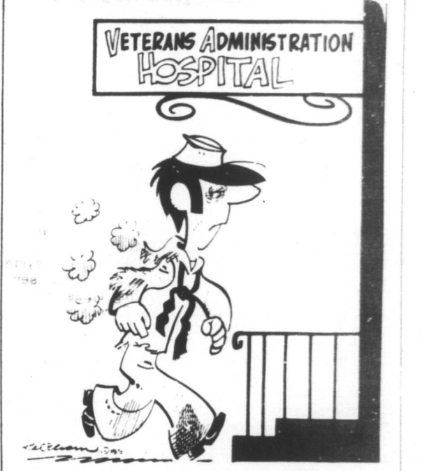
"DIDN'T EVEN HAVE TIME TO GET INTO MY CIVVIES BEFORE I MET THAT MARINE."

So says the VA... HALF HITCH by Hank Ketcham