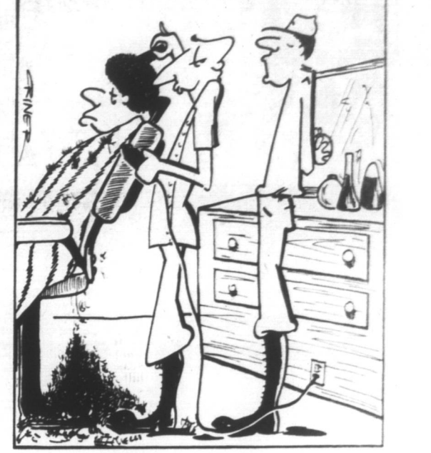
YES, I THINK THIS IS HIS FIRST TIME.

So says the VA... HALF HITCH by Hank Ketcham