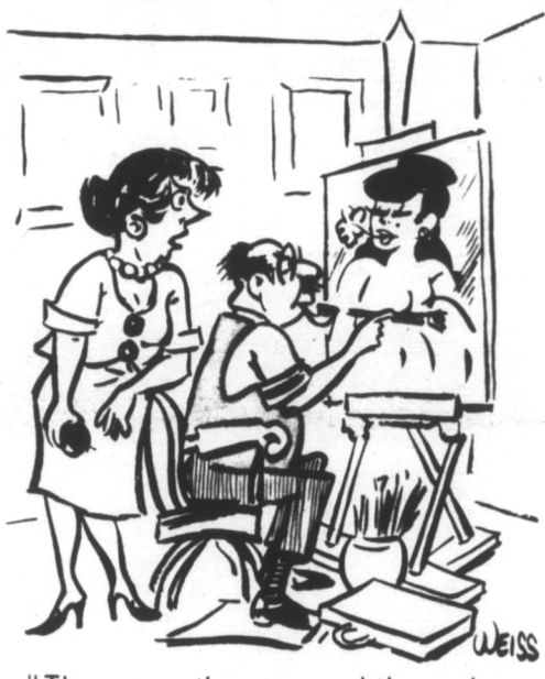
"The vases, the pears and the apples, what became of them?" 64

If you like the idea of keeping 'em flying, you'll like the Army Reserve.