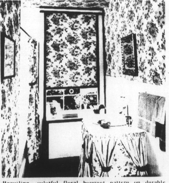
Beguiling, colorful floral bouquet pattern on

In the bedroom, "Boutique Stripe" is the dominant pattern. Instead of regulation pillow cases, shams made with the stripe on the bias adds design interest. Solid color borders are the cut-off sheet hems. Left-over scraps may be used to back bedside' bookshelves and to cover the chair pad. The sheer washable Fortrel ready-made curtains, trimmed with braid on the shade, are as practical as they