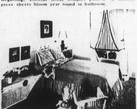
Fortrel shag carpet is a strong color accent.