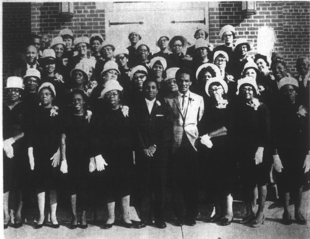
PASTOR'S AID CLUB