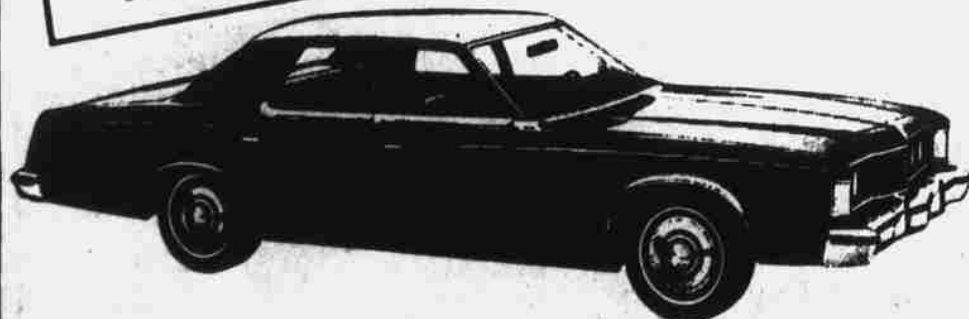
1973 FORD CUSTOM—Stock No. 1082

Ford Custom 500 4-Door, Automatic Transmission, Radio, Heater, Factory Air Conditioning, Many Other Extras.