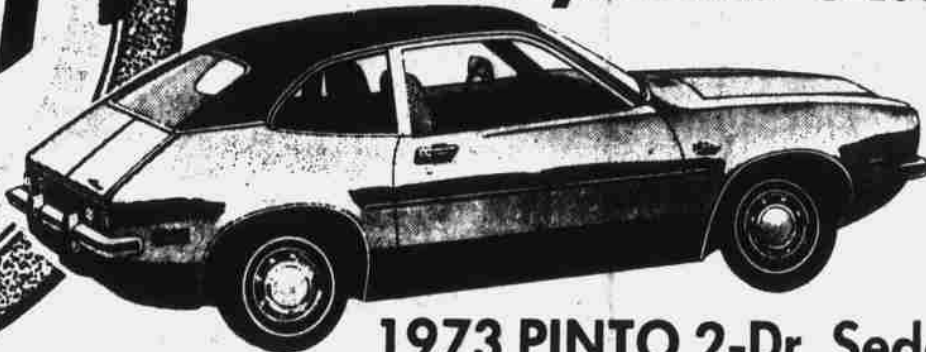
1973 PINTO 2-Dr. Sedan

Yellow Gold Finish, 4-Speed Transmission, Deluxe Bumper Guards, AM Radio, Vinyl Body Molding, W-C.