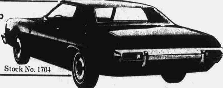
Stock No. 1704