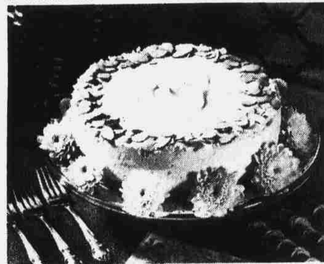
PEACH ALMOND CREAM (Makes 8 servings)

Peach Almond Cream is a great dessert for bridal shower, baby shower or any festive get-together. A creamy almond whip is layered over peach halves in a graham cracker crust. Velvetized evaporated milk adds special body and smooth texture to the whip. You'll like the results.