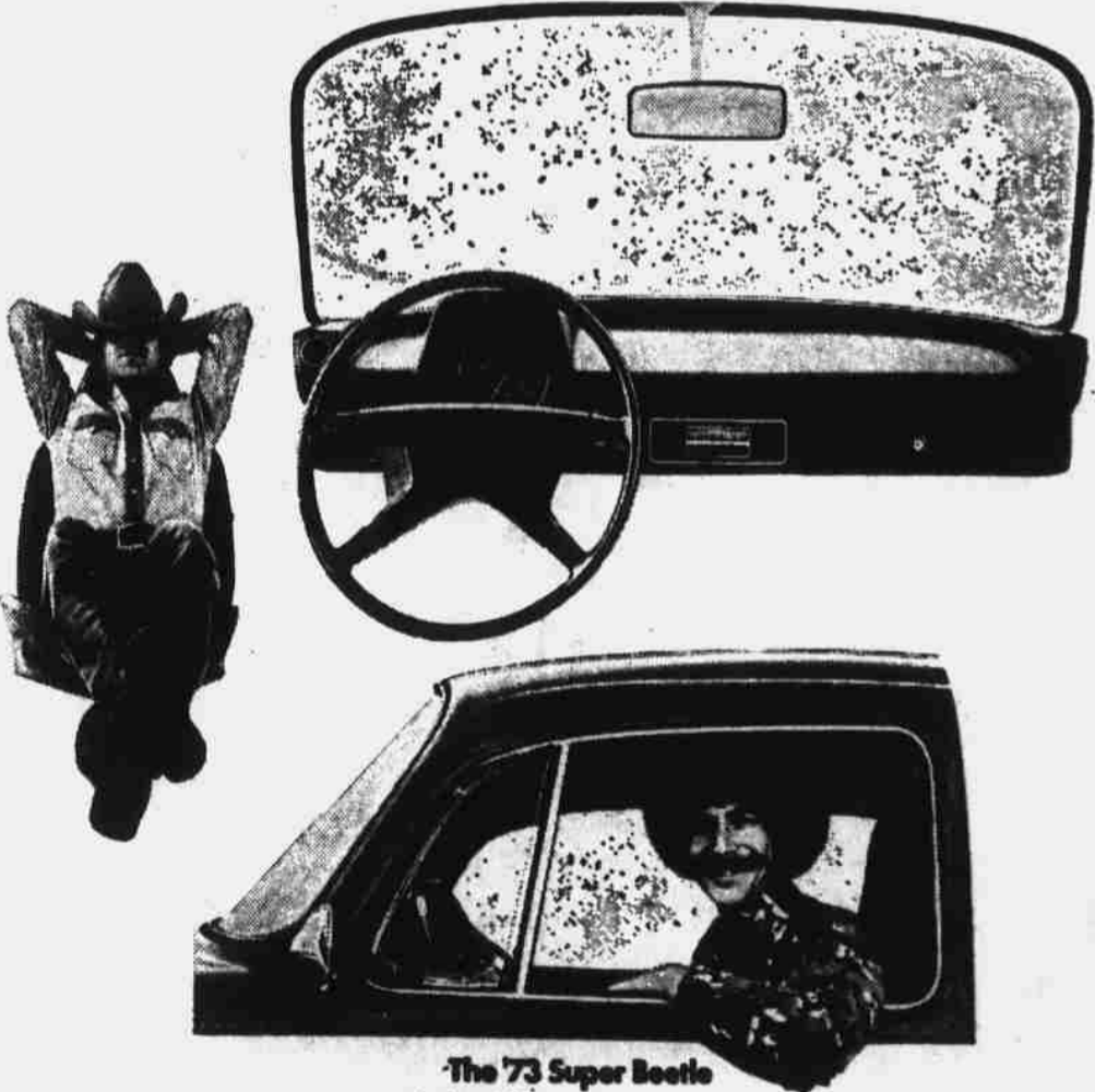
The '73 Super Beetle Few things in life work as well as a Volkswagen.

for back-seat drivers to get into the back seat.) There's a new kind of seat belt (inertia-type) that lets up on you when you wiggle around, but holds you tight in a sudden stop. There's a completely redesigned padded dash. An improved ventilation system that defogs the side windows quicker. Altogether—20 improvements. And all this for the kind of price you'd expect from Volkswagen. Which is really a comfort.