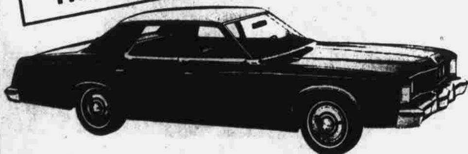
1973 FORD CUSTOM—Stock No. 1082