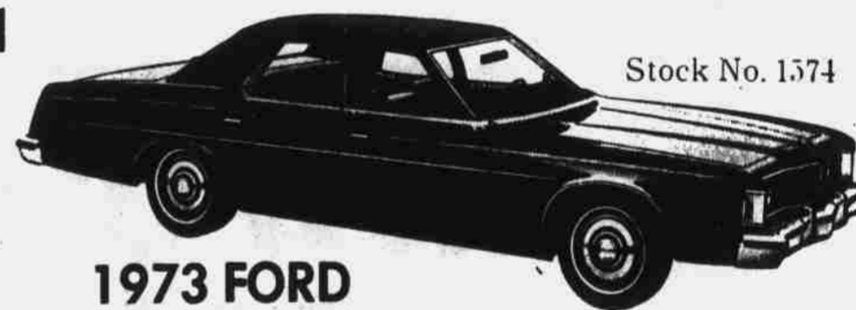
Stock No. 1574

Cash or Trade Amount to be Financed..... $1900