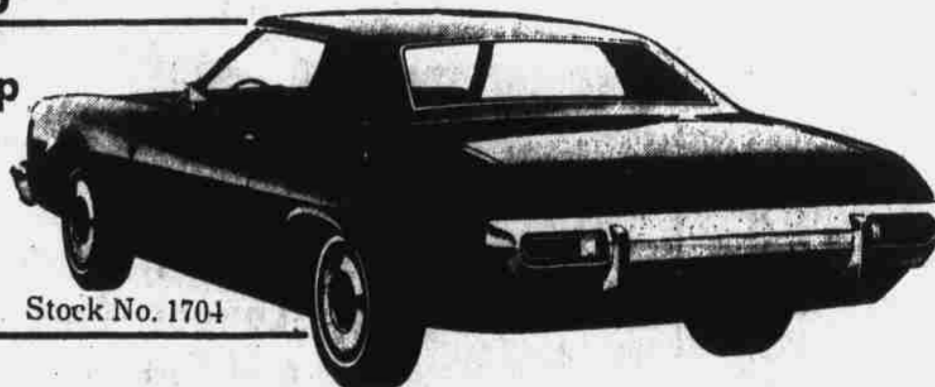
Stock No. 1704