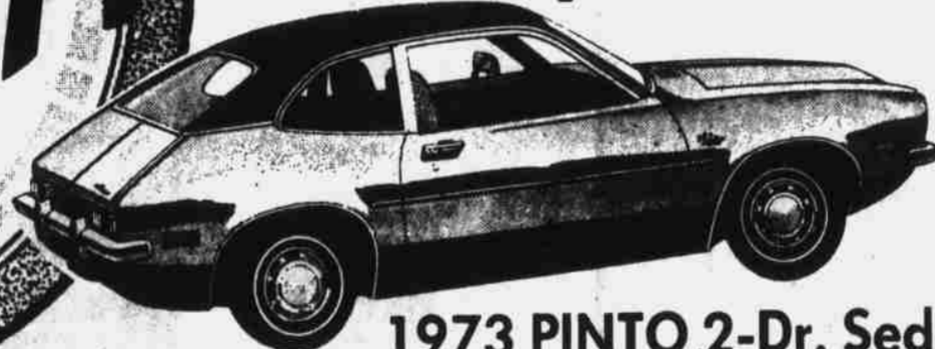
1973 PINTO 2-Dr. Sedan

Yellow Gold Finish, 4-Speed Transmission, Deluxe Bumper Guards, AM Radio, Vinyl Body Molding, W-C.