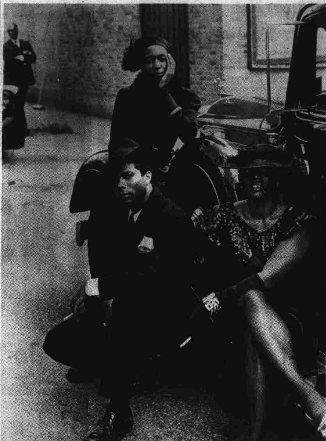
THE GOOD TIMES — Decked out in their newest finery three of the "colored elite" await the start of another evening of good times. The time is the 1930's and they all appear in the Joseph E.