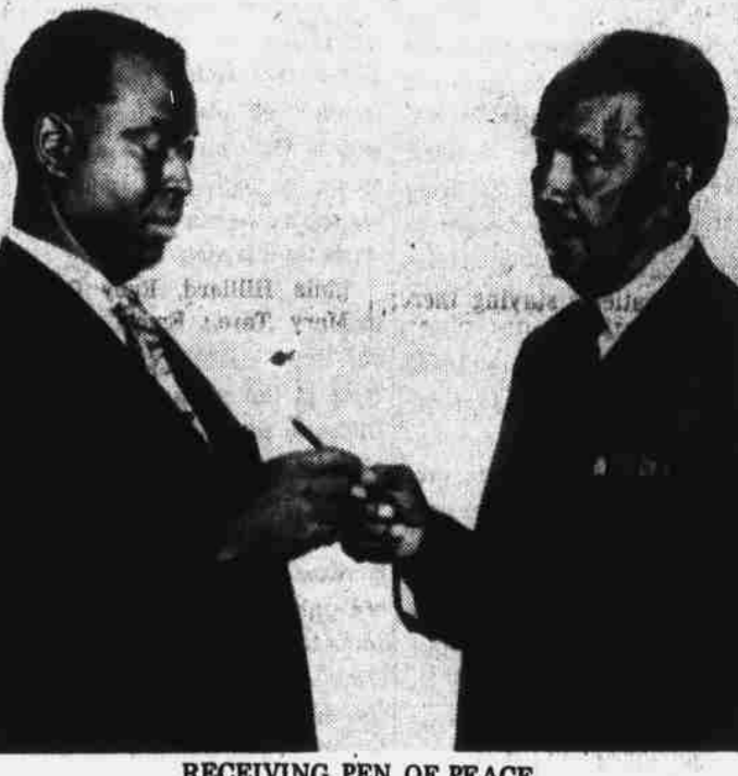
RECEIVING PEN OF PEACE

The fastest growing tree is the Eucalyptus saligna, which has been known to grow 45 feet in two years in central Africa. (Bamboo grows even faster but is technically a wood grass, not a tree.) Among standard game birds, the fastest is the spur-winged goose. It has been clocked at 88 m.p.h. in level flight. The fastest recorded wing beat among all birds belongs to a male hummingbird: 80 beats per second. The fastest selling record of all time is "John Fitzgerald Kennedy—A Memorial Album." It sold four million copies at 99¢ in six days. The fastest passenger elevators in America are probably those in the 100-story, 1,107-foot-tall John Hancock Building in Chicago. They run at a speed of 1,600 feet per minute!