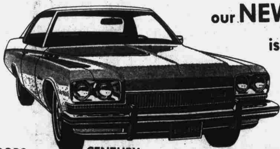
LeSABRE HARDTOPS & 4 DOORS

Our one big chance to send the Boss, on a long, long journey. Win the Buick Spring Selling Spree in this district. Last week we learned if we offered the right deals, people were ready to buy. This week we're more ready to trade than ever. Best prices of the year. If it breaks him, we're determined to win this trip for the Boss. We've got to get him out of town. We need the vacation ourselves. Hopefully, we can send the Sales Manager along, too.