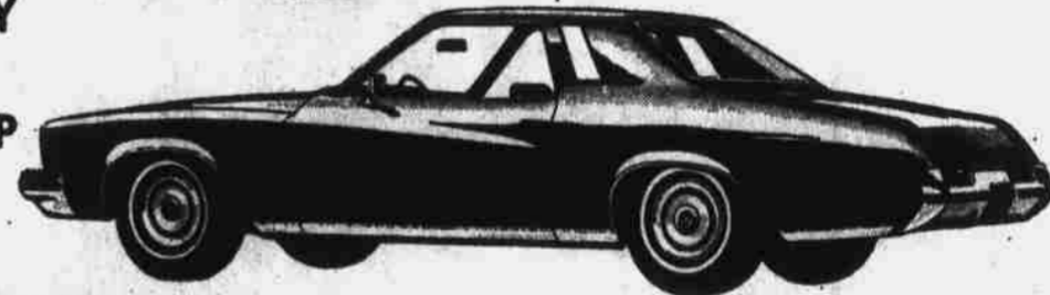
CENTURY LUXUS HARDTOP