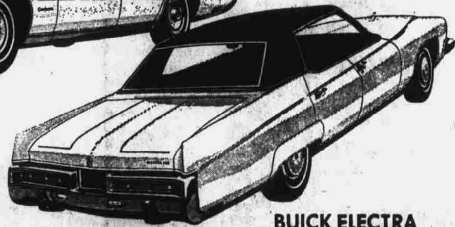
BUICK ELECTRA 4-DOOR HARDTOP