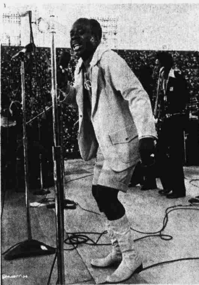
DRESSED IN HOT PINK Dance," whips up the crowd as Rufus Thomas, "Prince of the he performs in "WATTSTAX."

We see Albert King and Little Milton sing about the blues and Johnny Taylor sing about Jody to a room full of nightclub people. The Staple Singers exhort the audience to "Respect Yourself." In subsequent scenes filmed in a barbershop and beauty salon, Black people talk about awareness and self-respect.