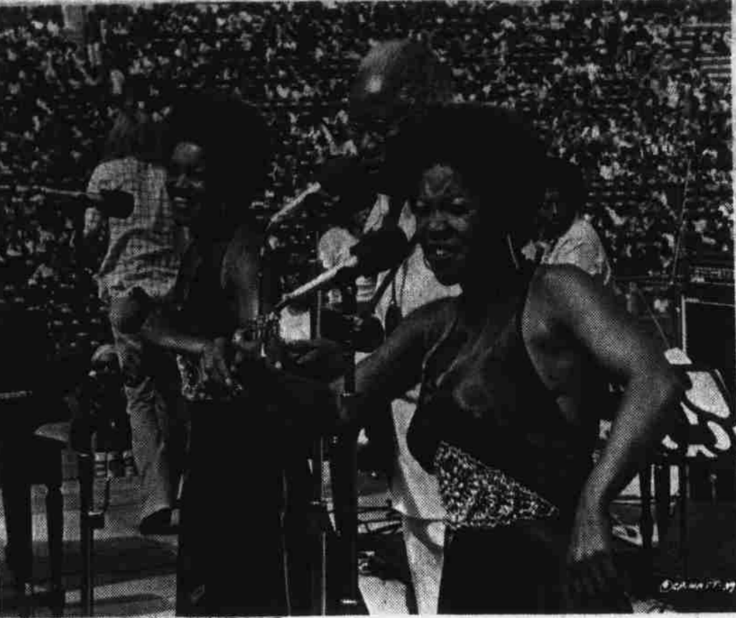
THE STAPLE SINGERS, synonymous with the finest in Gospel music, perform in "WATTSTAX."

For more information on buses, trains and luggage, write to Interstate Commerce Commission, Washington, D.C. 20423.