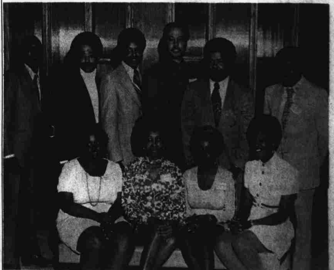
VENTURE MANAGEMENT GRADUATES — Durham graduates of the University of North Carolina's Venture Management program for small

The 40 graduates of this year's program completed 12 evening sessions on leadership, financial management, accounting, and marketing under the direction of the Business School faculty and faculty members of North Carolina Central University in Durham. The faculty were assisted in developing program (See BUSINESS 2A)